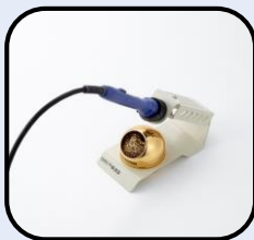
Stand with Tip cleaner #633-01